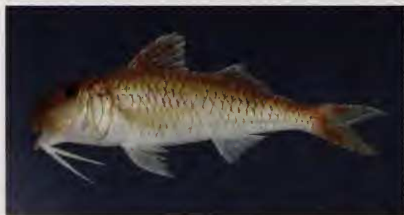
Fig. 7. Holotype of Parupeneus nansen , SAIAB 81380, 125 mm SL, Mozambique, 24°33'S, 35°15'E, 50–51 m (Photo by P.C. Heemstra).

DIAGNOSIS. Pectoral-fin rays 15 or 16; gill rakers 6 or 7 + 21–23; body moderately elongate, the depth 3.6–3.85